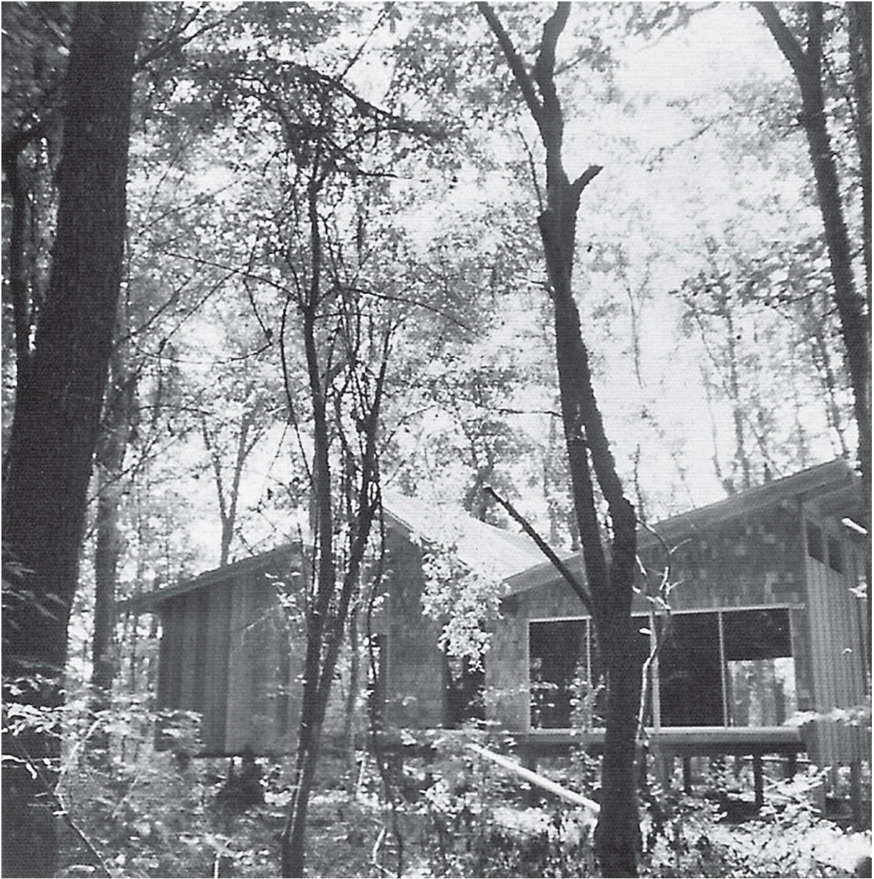
The Temple of the Universe, with its dynamic butterfly roof, under construction, 1975.