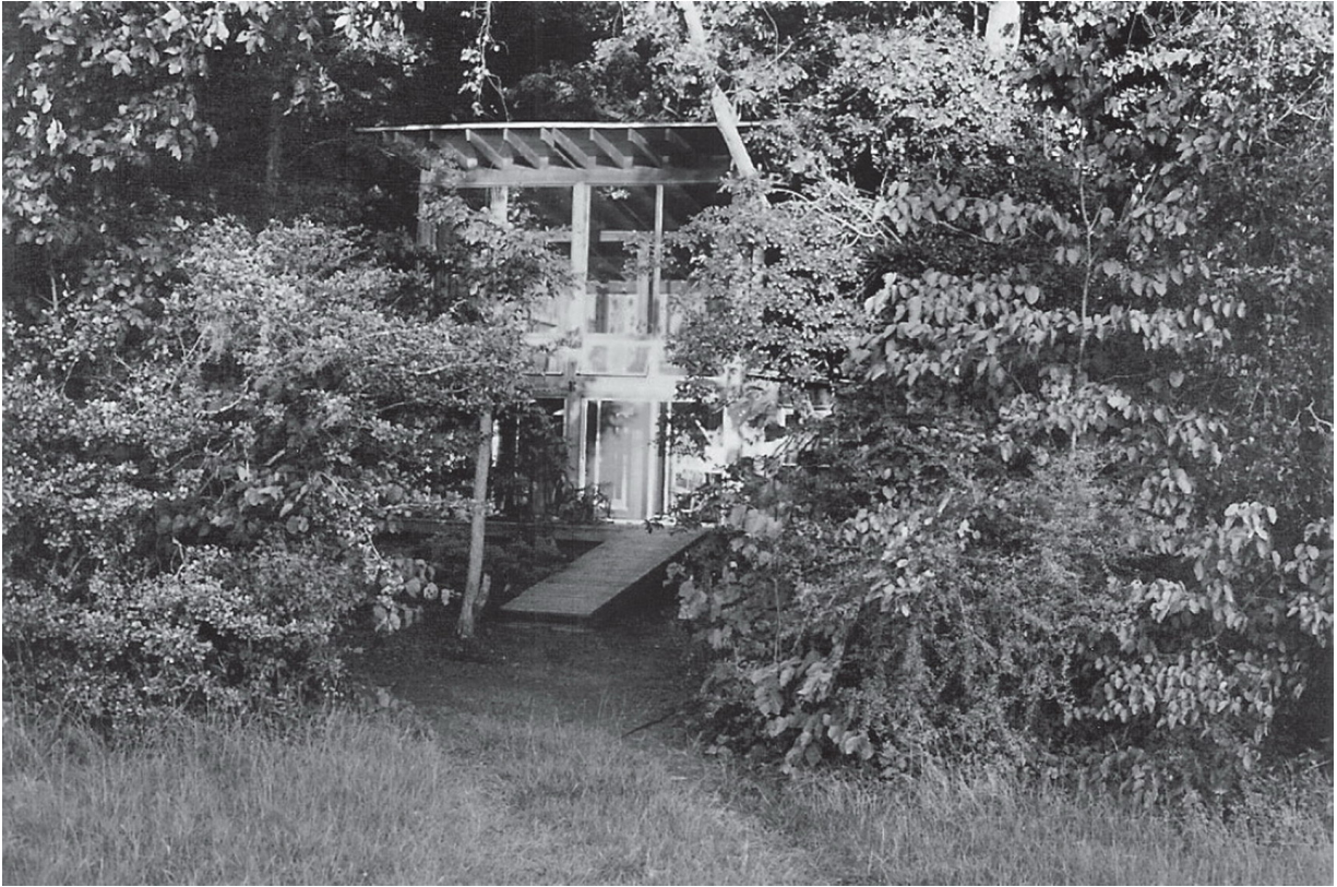
House finished—time for solitude.