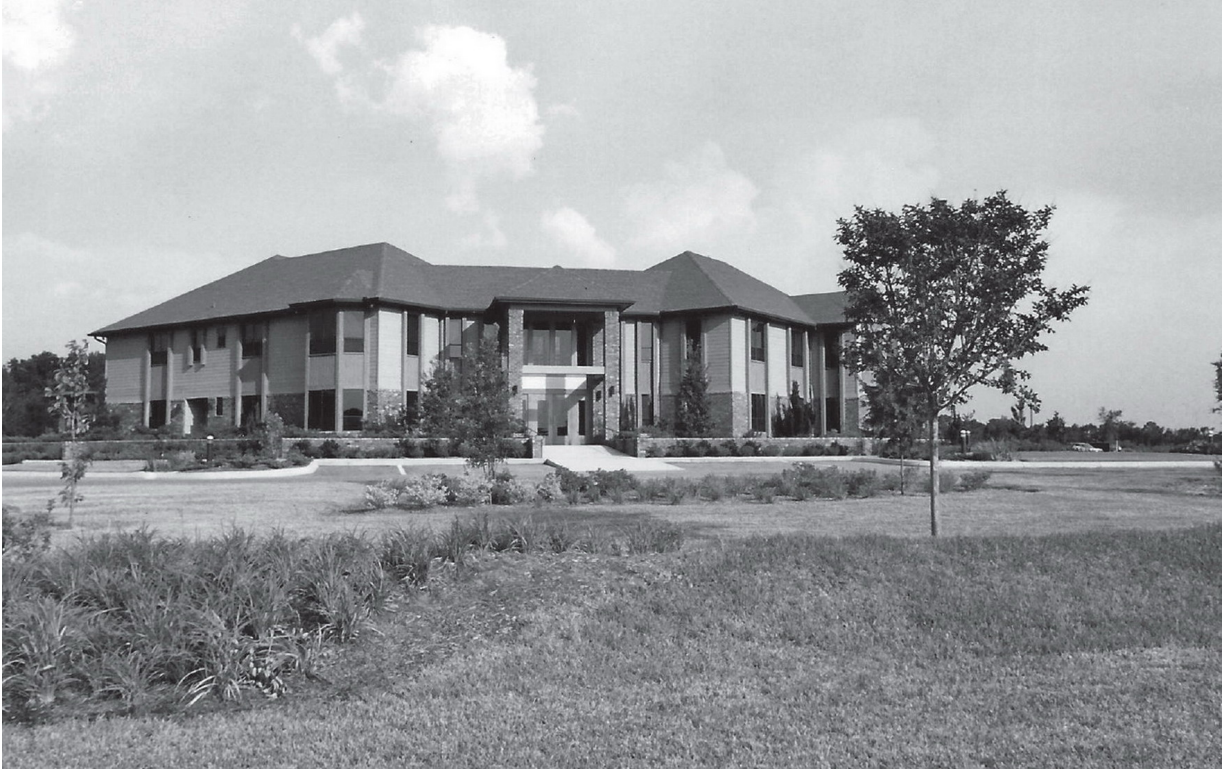
Personalized Programming, 1993. They said it was impossible, yet life manifests this gorgeous new office building bordering Temple property. What an amazing flow of events!