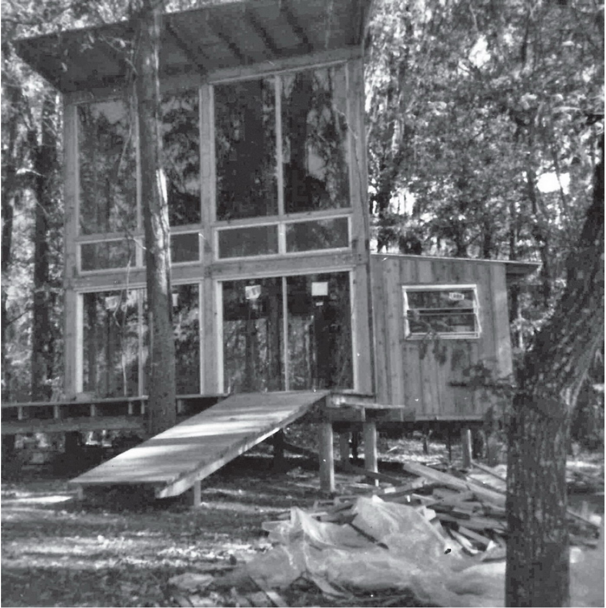
November 1971: All I wanted was a tiny meditation hut—just look at what life gave us to build!