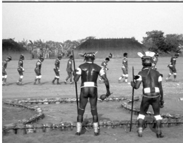
Kuikuro Indians participate in one of their most sacred rituals, the Kuarup, which honors the dead.