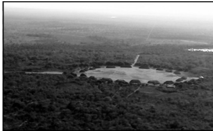
An aerial shot of the Kuikuro settlement with its circular plaza and domed houses along the perimeter.