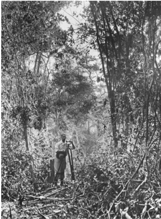
Fawcett mapping the frontier between Brazil and Bolivia in 1908.