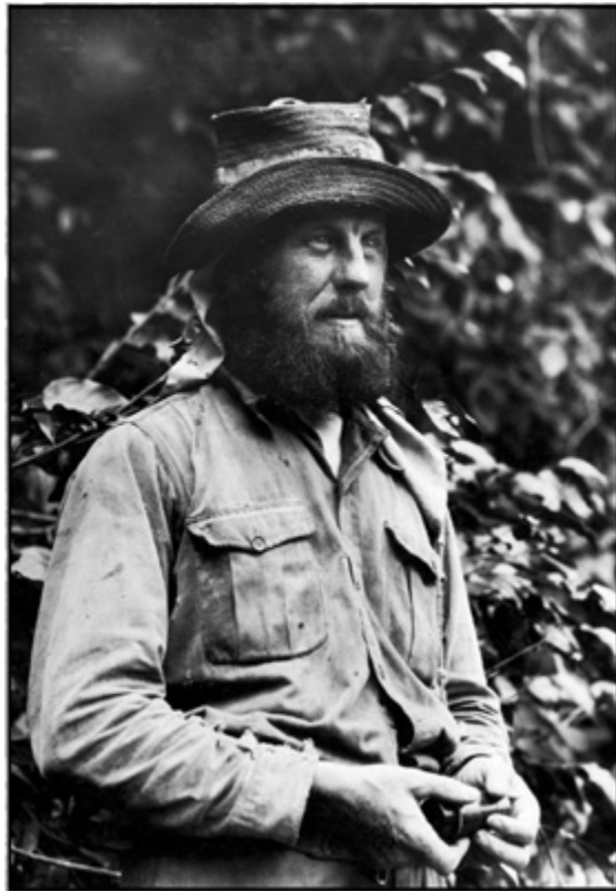
In 1928 Commander George M. Dyott launched the first major mission to rescue Fawcett.