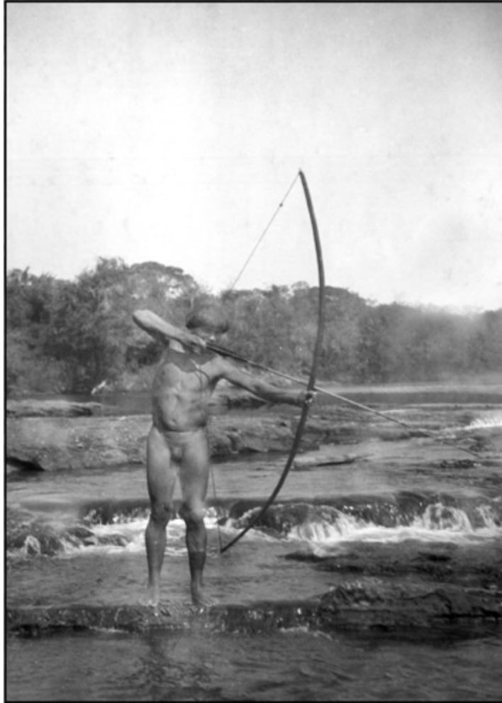
An Indian in the Xingu fishes with bow and arrow in 1937. Many scientists believed the Amazon could not provide sufficient food to sustain a large, complex civilization.