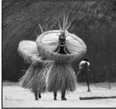
Two Kuikuro Indians dance in celebration of the “whirlwind” spirit.