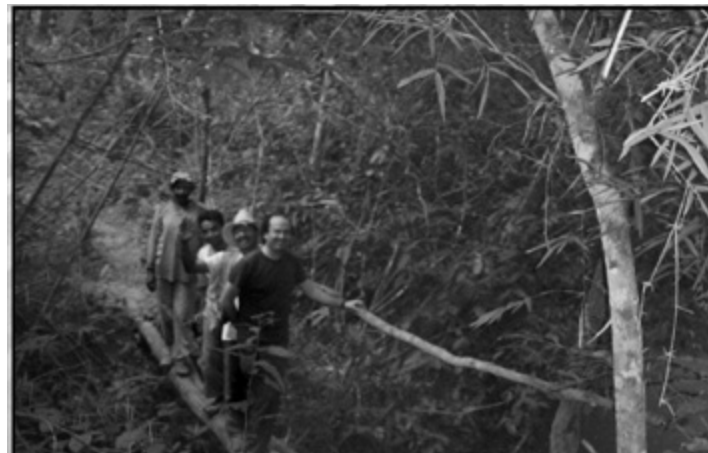
The author (front) treks with Bakairí Indians through the jungle along the same route that Fawcett followed eighty years earlier.