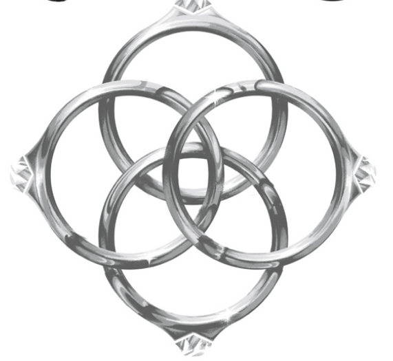
By Lynette Noni